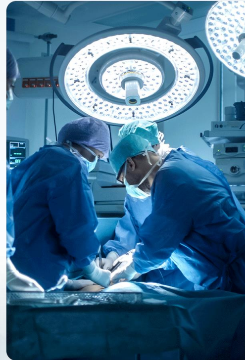
Travel for Treatment / Major Medical in the USA, Europe & APAC region