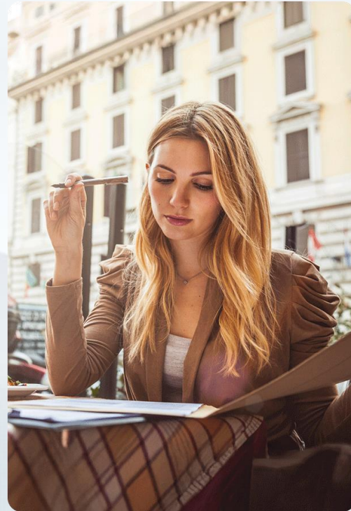
iPMI / Expats / Students / Long-term Retirees