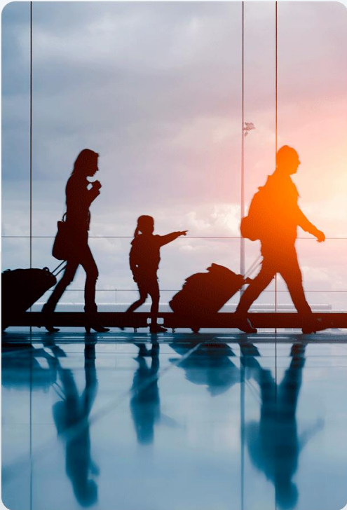
Leisure & Business Travel

...range of healthcare risk management solutions for: